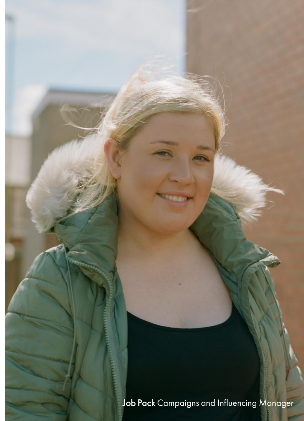
Job Pack Campaigns and Influencing Manager